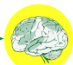
Assessment of neurocognitive performance

1 Neuroimaging (fMRI) showed increased activation of brain regions associated with working memory and attention.